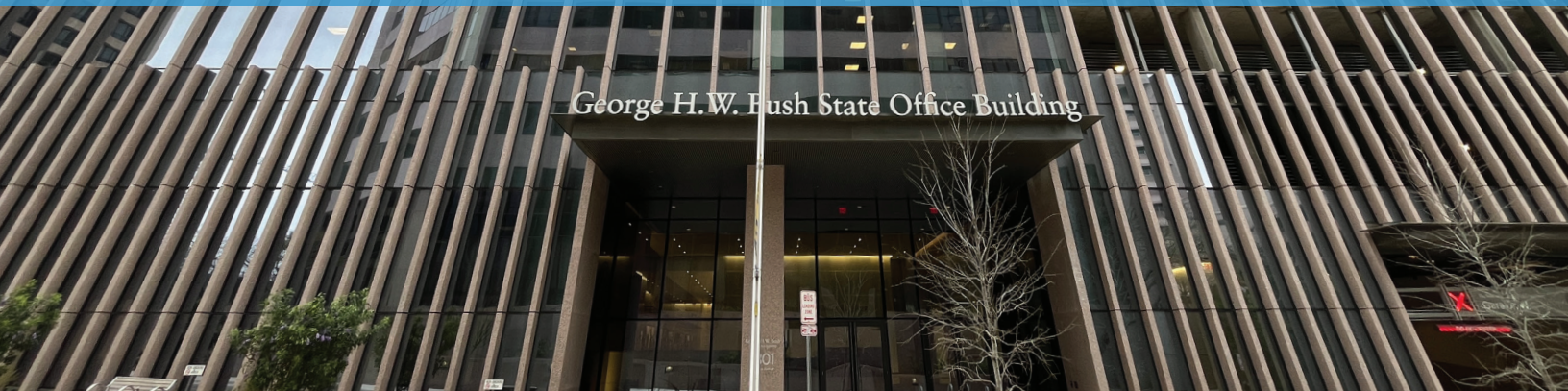
George H.W. Bush State Office Building